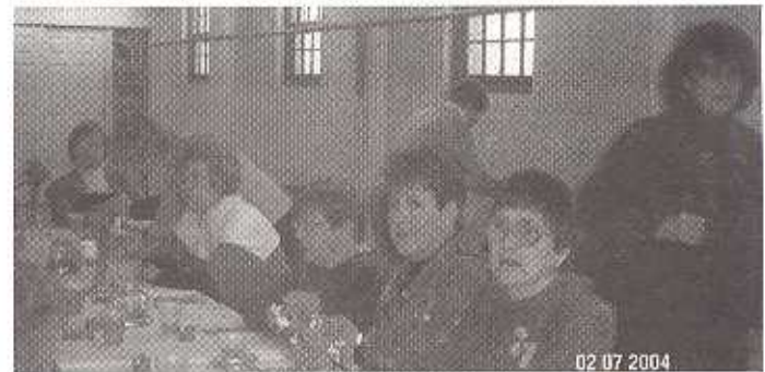
Michigan City and LaPorte's joint luncheon

Each book relates to a different group of people and encourages each of us to view things from a different perspective than we may have now. Read these yourself and/or form a group to discuss them. Everyone can benefit from the exchange of ideas.