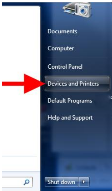
Step 2 - Start Menu