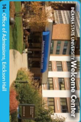
14 - Office of Admissions, Erickson Hall