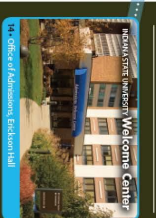
14 - Office of Admissions, Erickson Hall